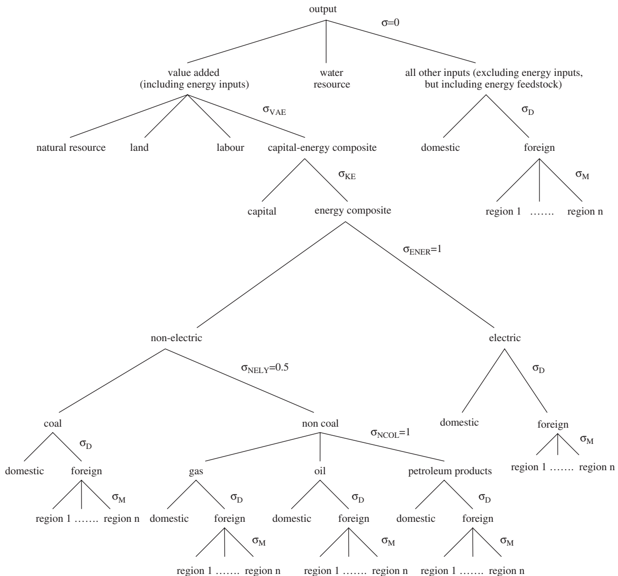
Fig. A1 – Nested tree structure for industrial production process.

Aggregations in GTAP-W are shown in Table A1. Regional characteristics are shown in Table A2. Substitution elasticities